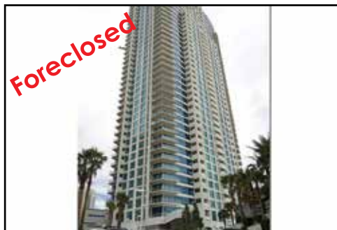
Ref #1380006 • 2 Bedrooms • 2 Baths 1100 Sq. Ft. • Year: 2006 Sky Las Vegas • $209,900