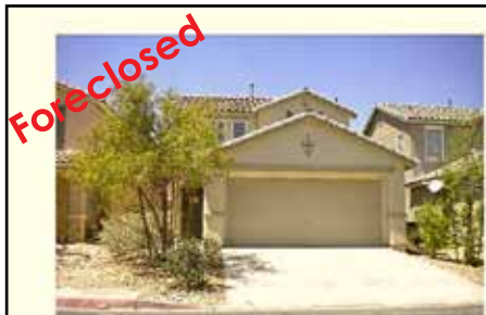
Ref #1344957 • 3 Bedrooms • 2.5 Baths • 1865 Sq. Ft. Year: 2005 • Lot Size: 3485 Sq. Ft. Terracina • $193,600