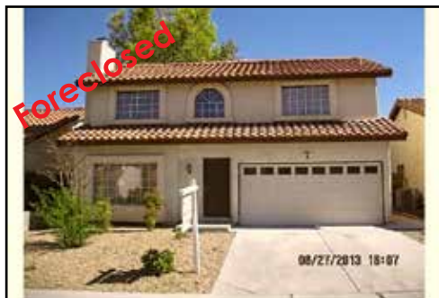
Ref #1359335 • 3 Bedrooms • 2.5 Baths • 1536 Sq. Ft. Year: 1985 • Lot Size: 4356 Sq. Ft. Covered Patio • Bayside • $184,900