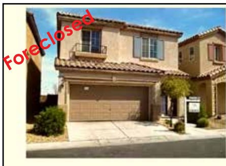
Ref #1332083 • 4 Bedrooms • 2.5 Baths • 1645 Sq. Ft. Year: 2008 • Lot Size: 2178 Sq. Ft. Covered Patio • Mandolin • $180,100