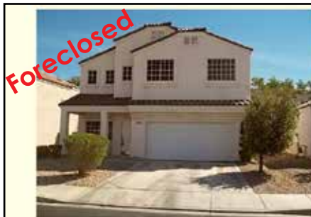
Ref #1336456 • 3 Bedrooms • 2.5 Baths • 2024 Sq. Ft. Year: 2001 • Lot Size: 6098 Sq. Ft. Seven Hills • $224,900