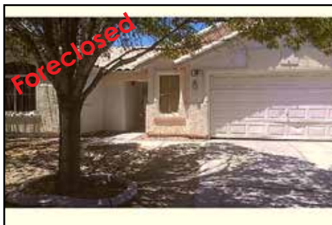
Ref #1356180 • 3 Bedrooms • 2 Baths • 1930 Sq. Ft. Year: 1995 • Lot Size: 6098 Sq. Ft. Covered Patio • $236,000