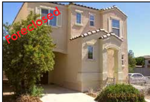
Ref #1355406 • 3 Bedrooms • 2.5 Baths • 1390 Sq. Ft. Year: 2004 • Lot Size: 2178 Sq. Ft. $172,000