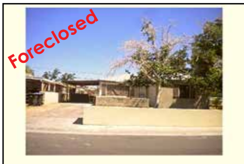
Ref #1353440 • 3 Bedrooms • 2 Baths • 1042 Sq. Ft. Year: 1952 • Lot Size: 6534 Sq. Ft. • 1 Carport $96,800