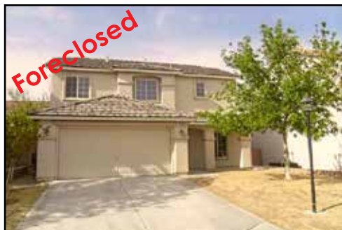
Ref #1338950 • 4 Bedrooms • 2.5 Baths • 2024 Sq. Ft. Year: 2002 • Lot Size: 4356 Sq. Ft. Covered Patio • Lone Mountain • $212,500