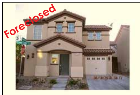
Ref #1358385 • 3 Bedrooms • 2.5 Baths • 1671 Sq. Ft. Year: 2007 • Lot Size: 3049 Sq. Ft. • Patio Huntington Village • $192,500