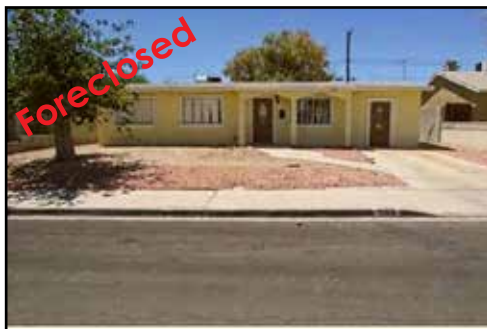
Ref #1360824 • 4 Bedrooms • 2.5 Baths • 1274 Sq. Ft. Year: 1963 • Lot Size: 6098 Sq. Ft. Charleston Heights • $126,500