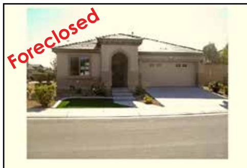
Ref #1344280 • 3 Bedrooms • 2 Baths • 2154 Sq. Ft. Year: 2007 • Lot Size: 9583 Sq. Ft. Covered Patio • $242,900