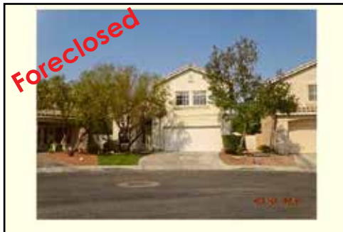
Ref #1359302 • 3 Bedrooms • 2.5 Baths • 1643 Sq. Ft. Year: 2000 • Lot Size: 6534 Sq. Ft. • Patio Avante Homes • $195,800