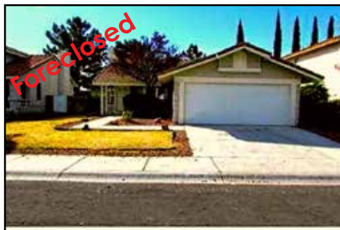
Ref #1356608 • 3 Bedrooms • 2 Baths • 1450 Sq. Ft. Year: 1985 • Lot Size: 5227 Sq. Ft. Covered Patio • Bluffs • $194,500