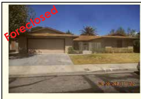
Ref #1336694 • 4 Bedrooms • 2 Baths • 1830 Sq. Ft. Year: 1976 • Lot Size: 6970 Sq. Ft. • Pool $199,900