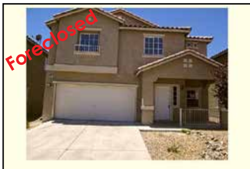
Ref #1360755 • 4 Bedrooms • 2.5 Baths • 2007 Sq. Ft. Year: 2005 • Lot Size: 4792 Sq. Ft. $204,900