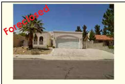
Ref #1356498 • 2 Bedrooms • 2 Baths • 1420 Sq. Ft. Year: 1987 • Lot Size: 6970 Sq. Ft. Sunrise View Estates • $159,500