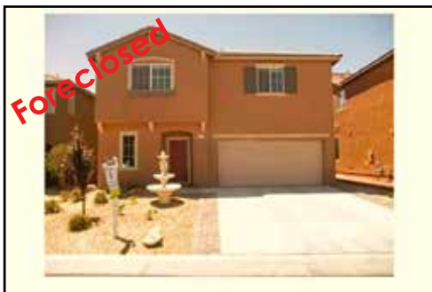
Ref #1355234 • 3 Bedrooms • 2.5 Baths • 2359 Sq. Ft. Year: 2006 • Lot Size: 4356 Sq. Ft. Covered Patio • South Mountain • $246,900