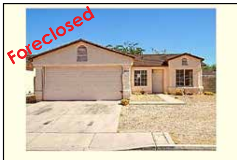
Ref #1361606 • 3 Bedrooms • 2 Baths • 1148 Sq. Ft. Year: 1995 • Lot Size: 5227 Sq. Ft. • Patio Fernwood • $75,000