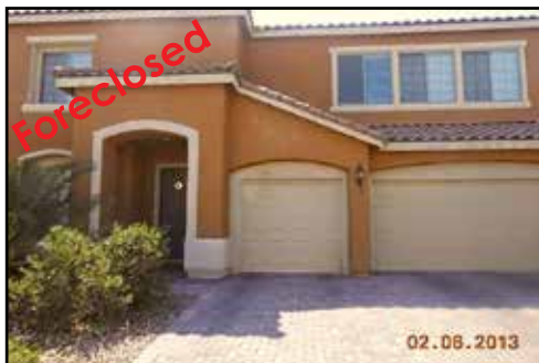
Ref #1356536 • 5 Bedrooms • 4 Baths • 3395 Sq. Ft. Year: 2007 • Lot Size: 6098 Sq. Ft. • Patio $224,900