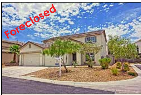
Ref #1352901 • 4 Bedrooms • 2.5 Baths • 2189 Sq. Ft. Year: 2005 • Lot Size: 6098 Sq. Ft. Concordia • $268,500