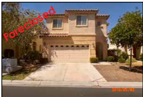
Ref #1347922 • 3 Bedrooms • 3 Baths • 2144 Sq. Ft. Year: 2003 • Lot Size: 4356 Sq. Ft. $249,900