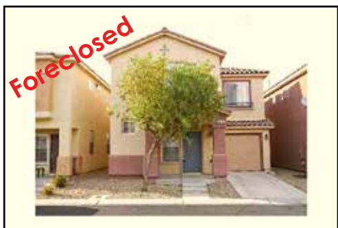
Ref #1360903 • 3 Bedrooms • 2.5 Baths • 1361 Sq. Ft. Year: 2005 • Lot Size: 1742 Sq. Ft. • Patio Copper Creek • $154,500