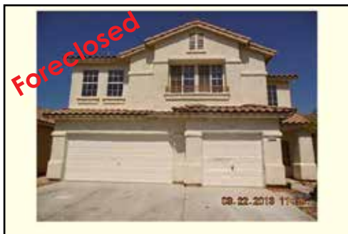
Ref #1333110 • 3 Bedrooms • 3.5 Baths • 2627 Sq. Ft. Year: 1997 • Lot Size: 5663 Sq. Ft. • Pool $259,100