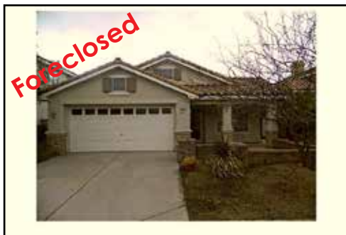
Ref #1329364 • 3 Bedrooms • 2 Baths • 1302 Sq. Ft. Year: 1994 • Lot Size: 4356 Sq. Ft. • Patio Pebble Creek • $176,500