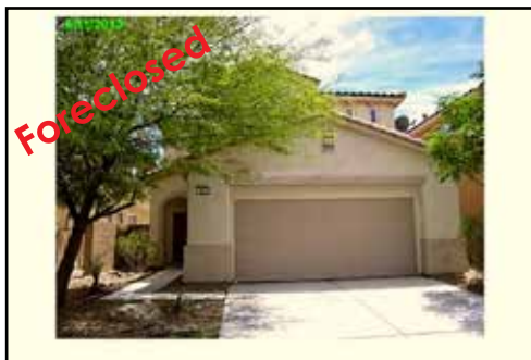
Ref #1345222 • 3 Bedrooms • 2.5 Baths • 2045 Sq. Ft. Year: 2004 • Lot Size: 3920 Sq. Ft. South Canyons • $239,900