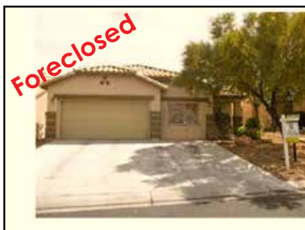
Ref #1352730 • 2 Bedrooms • 1 Den • 2 Baths 1920 Sq. Ft. • Year: 2000 • Lot Size: 6098 Sq. Ft. Patio • Appaloosa Canyon • $214,500