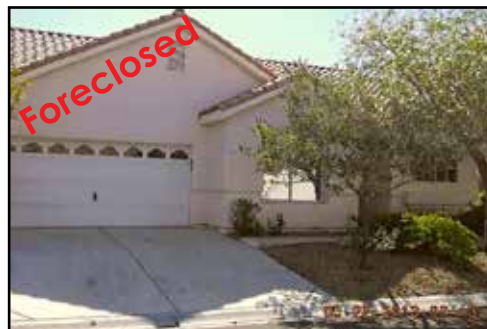
Ref #1348718 • 3 Bedrooms • 2 Baths • 1495 Sq. Ft. Year: 1994 • Lot Size: 4356 Sq. Ft. Covered Patio • Portraits at Painted Desert • $204,900