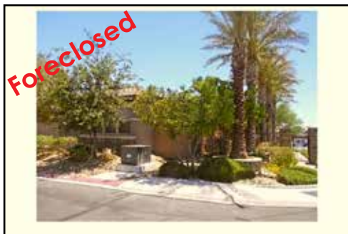
Ref #1353454 • 3 Bedrooms • 3 Baths • 2712 Sq. Ft. Year: 2006 • Lot Size: 8276 Sq. Ft. Covered Patio • Aliante • $341,100