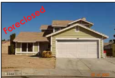
Ref #1346751 • 4 Bedrooms • 3 Baths • 2016 Sq. Ft. Year: 1984 • Lot Size: 9148 Sq. Ft. Spring Valley • $217,100