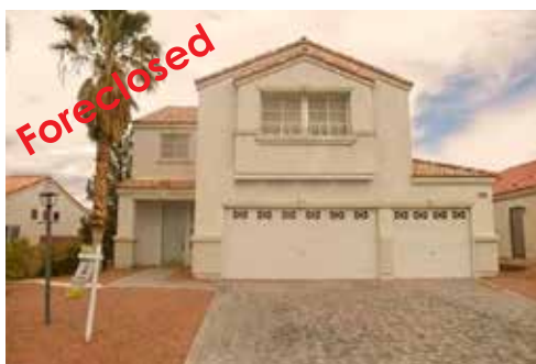
Ref #1345793 • 4 Bedrooms • 2.5 Baths • 2444 Sq. Ft. Year: 2002 • Lot Size: 6098 Sq. Ft. Covered Patio • Balcony • Stone Mountain • $236,100