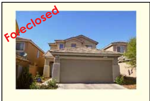
Ref #1362201 • 5 Bedrooms • 3 Baths • 1816 Sq. Ft. Year: 2006 • Lot Size: 3485 Sq. Ft. Riverwalk • $199,900