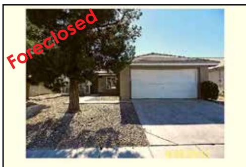
Ref #1360637 • 3 Bedrooms • 2 Baths • 1296 Sq. Ft. Year: 1995 • Lot Size: 5663 Sq. Ft. Covered Patio • Somerset Estates • $149,000