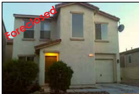
Ref #1342667 • 3 Bedrooms • 2.5 Baths • 1309 Sq. Ft. Year: 2004 • Lot Size: 3049 Sq. Ft. Edgewood • $119,500