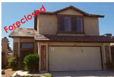
Ref #1336431 • 4 Bedrooms • 2.5 Baths • 1726 Sq. Ft. Year: 1984 • Lot Size: 3920 Sq. Ft. Covered Patio • Tanglewood • $157,500