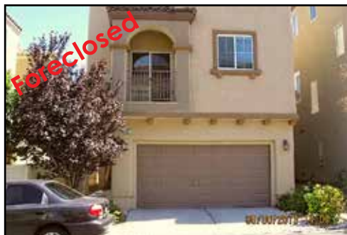
Ref #1358995 • 4 Bedrooms • 3 Baths • 1813 Sq. Ft. Year: 2007 • Lot Size: 1742 Sq. Ft. South Mountain • $209,500