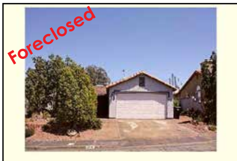
Ref #1339854 • 4 Bedrooms • 2 Baths • 1860 Sq. Ft. Year: 1991 • Lot Size: 6534 Sq. Ft. Hillcrest Manor • $198,900