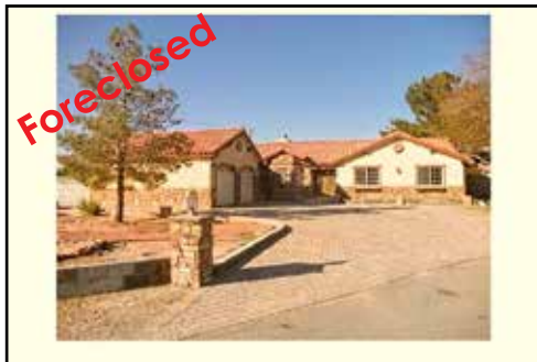
Ref #1323420 • 3 Bedrooms • 2.5 Baths • 2942 Sq. Ft. Year: 1991 • Lot Size: 20909 Sq. Ft. Covered Patio • $330,100