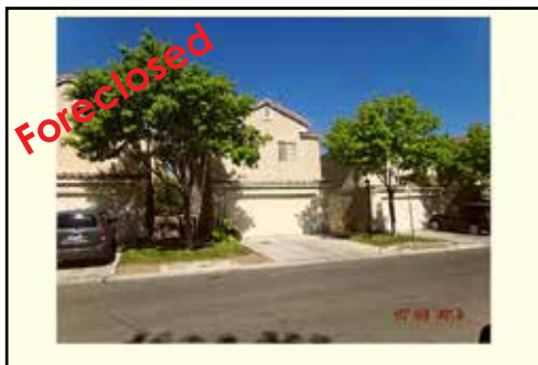
Ref #1363042 • 3 Bedrooms • 2.5 Baths • 1468 Sq. Ft. Year: 2000 • Lot Size: 3049 Sq. Ft. • Patio Spring Valley Ranch • $181,500