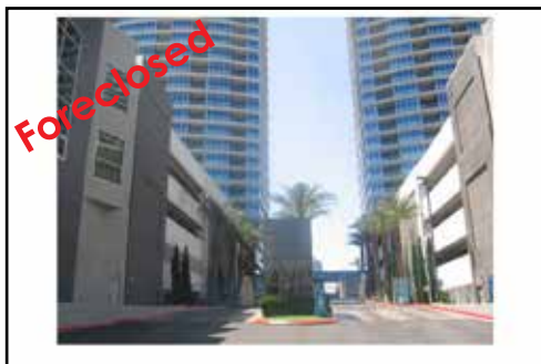
Ref #1349442 • 1 Bedroom • 1.5 Baths • 955 Sq. Ft. Year: 2005 Panorama • $249,900