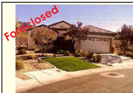
Ref #1315196 • 2 Bedrooms • 1 Den • 2 Baths 1596 Sq. Ft. • Year: 2005 • Lot Size: 10890 Sq. Ft. Covered Patio • Solera • $222,100