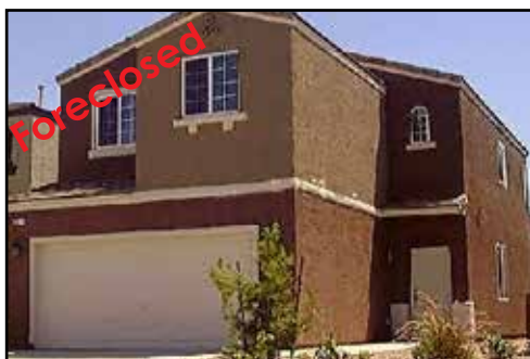
Ref #1361146 • 3 Bedrooms • 2.5 Baths • 2104 Sq. Ft. Year: 2006 • Lot Size: 3485 Sq. Ft. Wineridge Place • $232,500