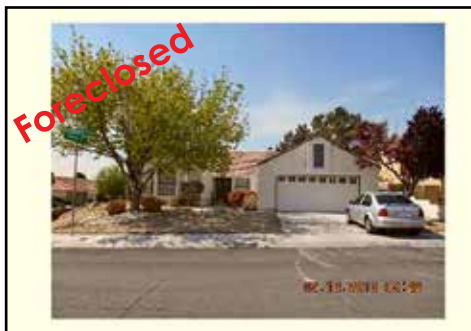
Ref #1352037 • 3 Bedrooms • 2 Baths • 1857 Sq. Ft. Year: 1987 • Lot Size: 7841 Sq. Ft. • Pool Beacon Point • $247,900