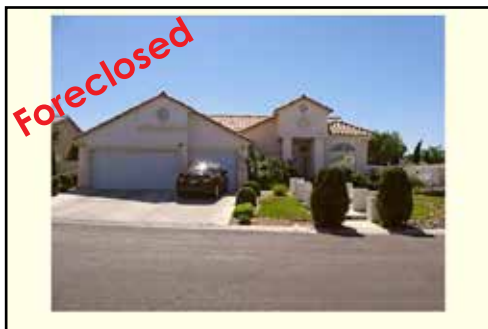
Ref #1352324 • 4 Bedrooms • 2 Baths • 2457 Sq. Ft. Year: 1998 • Lot Size: 15246 Sq. Ft. • Patio Pool • Willowdale Park • $274,900