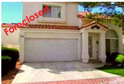
Ref #1356813 • 3 Bedrooms • 2.5 Baths • 1347 Sq. Ft. Year: 1996 • Lot Size: 1742 Sq. Ft. American West Village • $167,500