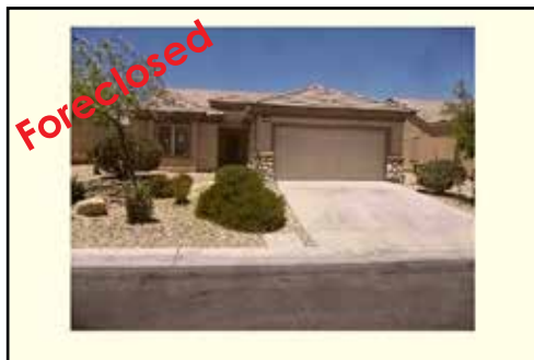
Ref #1358881 • 2 Bedrooms • 1 Den • 2 Baths 1570 Sq. Ft. • Year: 2004 • Lot Size: 6534 Sq. Ft. Covered Patio • Sun City • $255,300