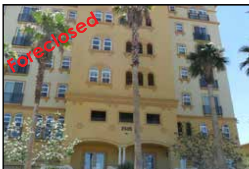
Ref #1359706 • 2 Bedrooms • 2 Baths • 1196 Sq. Ft. Year: 2007 Boca Raton • $164,900