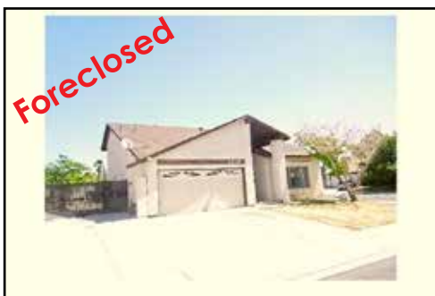
Ref #1355722 • 4 Bedrooms • 3 Baths • 1872 Sq. Ft. Year: 1981 • Lot Size: 7841 Sq. Ft. • Pool Covered Patio • Lone Mountain Estates • $140,000