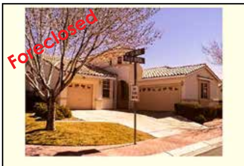
Ref #1329277 • 4 Bedrooms • 3 Baths • 2356 Sq. Ft. Year: 1999 • Lot Size: 7405 Sq. Ft. • Patio Seven Hills • $345,100