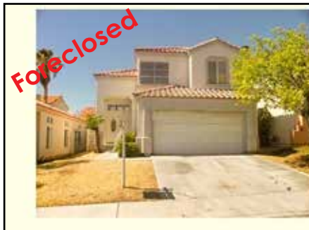
Ref #1356764 • 3 Bedrooms • 2.5 Baths • 1704 Sq. Ft. Year: 1991 • Lot Size: 4356 Sq. Ft. • Pool Covered Patio • Cypress • $264,100