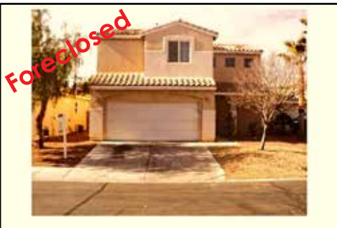
Ref #1320666 • 3 Bedrooms • 2.5 Baths • 1529 Sq. Ft. Year: 1998 • Lot Size: 4356 Sq. Ft. Covered Patio • Moondance • $170,500

Don't see what you want? Call or Visit our website! 878-SAVE • BUYLVFORECLOSURE.COM (7283)