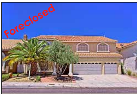
Ref #1357080 • 4 Bedrooms • 3 Baths • 3895 Sq. Ft. Year: 1997 • Lot Size: 6098 Sq. Ft. • Pool Covered Patio • Balcony • Legacy • $473,100