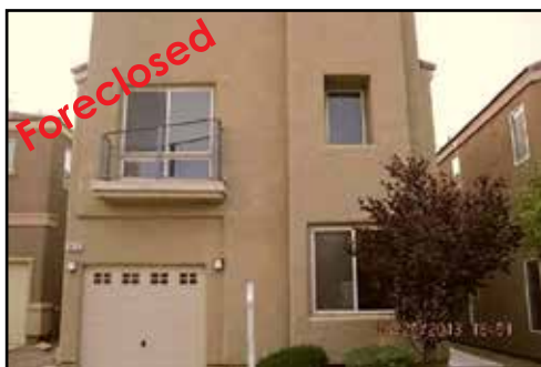
Ref #1338003 • 2 Bedrooms • 2.5 Baths • 1390 Sq. Ft. Year: 2006 • Lot Size: 2178 Sq. Ft. • Patio South Mountain • $169,000