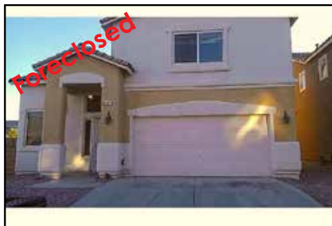
Ref #1356105 • 4 Bedrooms • 2.5 Baths • 1960 Sq. Ft. Year: 2006 • Lot Size: 5663 Sq. Ft. Pecos Park • $198,100