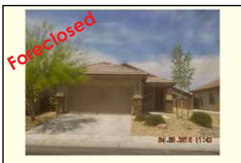
Ref #1342881 • 2 Bedrooms • 2 Baths • 1157 Sq. Ft. Year: 2007 • Lot Size: 5227 Sq. Ft. Stallion Mountain • $174,900