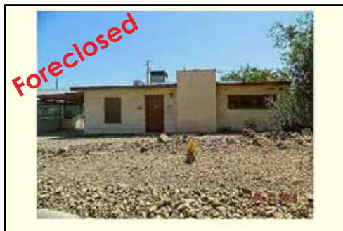
Ref #1341396 • 3 Bedrooms • 2 Baths • 1613 Sq. Ft. Year: 1942 • Lot Size: 5663 Sq. Ft. • 1 Carport Covered Patio • $79,200