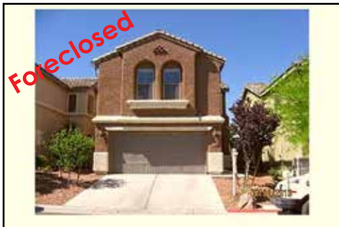
Ref #1343925 • 4 Bedrooms • 3 Baths • 2107 Sq. Ft. Year: 2007 • Lot Size: 3485 Sq. Ft. • Patio Lone Mountain • $217,500

Don't see what you want? Call or Visit our website! 878-SAVE • BUYLVFORECLOSURE.COM (7283)