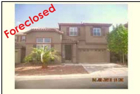
Ref #1336324 • 3 Bedrooms • 2.5 Baths • 2210 Sq. Ft. Year: 2004 • Lot Size: 3485 Sq. Ft. Toscana Vineyards • $248,500