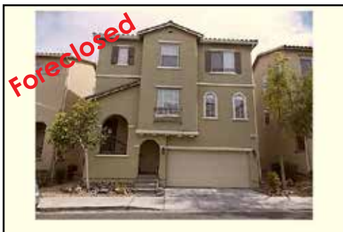
Ref #1357417 • 3 Bedrooms • 3.5 Baths • 1670 Sq. Ft. Year: 2006 • Lot Size: 1742 Sq. Ft. • Patio Whitney Heights • $149,900

Don't see what you want? Call or Visit our website! 878-SAVE • BUYLVFORECLOSURE.COM (7283)