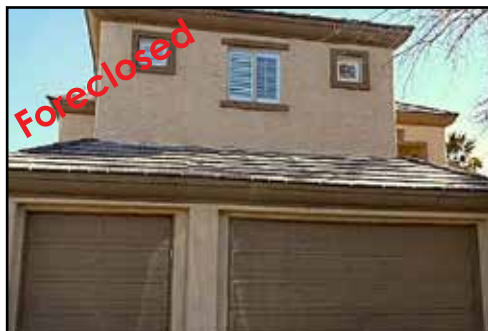
Ref #1343927 • 5 Bedrooms • 3.5 Baths • 4704 Sq. Ft. Year: 1997 • Lot Size: 13939 Sq. Ft. • Pool Covered Patio • Balcony • $539,900