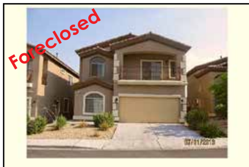
Ref #1362263 • 4 Bedrooms • 3 Baths • 2294 Sq. Ft. Year: 2008 • Lot Size: 3920 Sq. Ft. Covered Patio • Balcony • Day Dawn Vista • $185,000