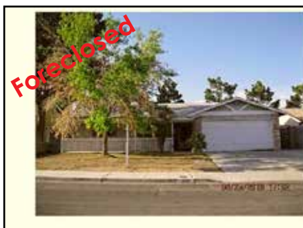
Ref #1342878 • 3 Bedrooms • 2 Baths • 1605 Sq. Ft. Year: 1979 • Lot Size: 6534 Sq. Ft. Covered Patio • Kingswood Estates • $159,900