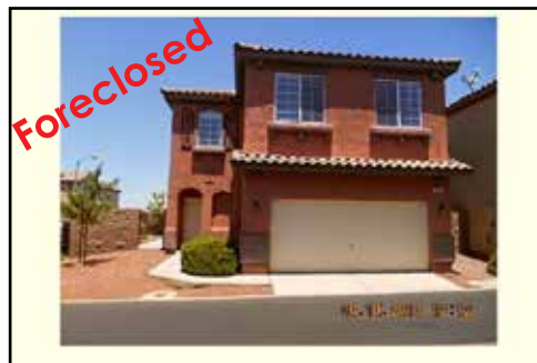
Ref #1356613 • 3 Bedrooms • 2.5 Baths • 1748 Sq. Ft. Year: 2004 • Lot Size: 3485 Sq. Ft. • Patio Triana • $214,900