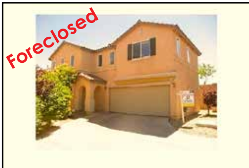
Ref #1350417 • 4 Bedrooms • 2.5 Baths • 1572 Sq. Ft. Year: 2004 • Lot Size: 2614 Sq. Ft. Spring Mountain Ranch • $170,800

Don't see what you want? Call or Visit our website! 878-SAVE • BUYLVFORECLOSURE.COM (7283)