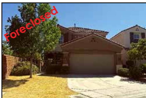
Ref #1355227 • 3 Bedrooms • 2.5 Baths • 1923 Sq. Ft. Year: 2003 • Lot Size: 5663 Sq. Ft. Southstar • $275,100