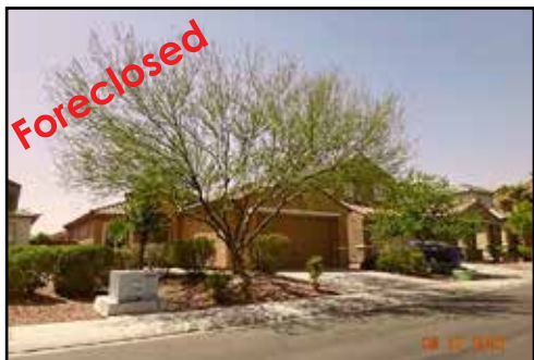
Ref #1337822 • 3 Bedrooms • 0 Bath • 1692 Sq. Ft. Year: 2004 • Lot Size: 5227 Sq. Ft. Aliante • $176,100