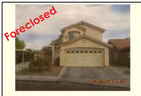
Ref #1342906 • 3 Bedrooms • 2.5 Baths • 1631 Sq. Ft. Year: 1996 • Lot Size: 3920 Sq. Ft. Echo Ridge • $137,500