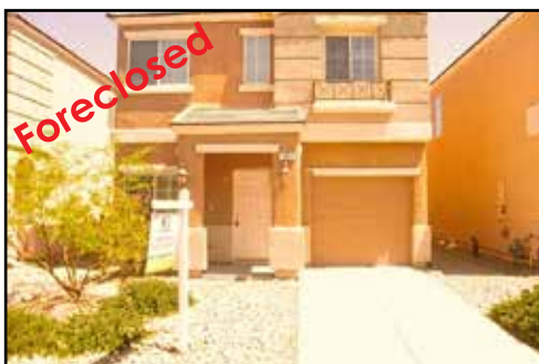
Ref #1362538 • 2 Bedrooms • 2.5 Baths • 1170 Sq. Ft. Year: 2006 • Lot Size: 2178 Sq. Ft. • Patio $115,900