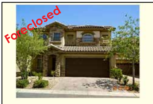
Ref #1344761 • 5 Bedrooms • 2.5 Baths • 2399 Sq. Ft. Year: 2007 • Lot Size: 3920 Sq. Ft. Pyrenees • $259,000