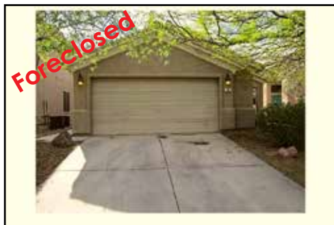
Ref #1334723 • 3 Bedrooms • 2 Baths • 1336 Sq. Ft. Year: 2001 • Lot Size: 3920 Sq. Ft. Covered Patio • Traditions • $149,800