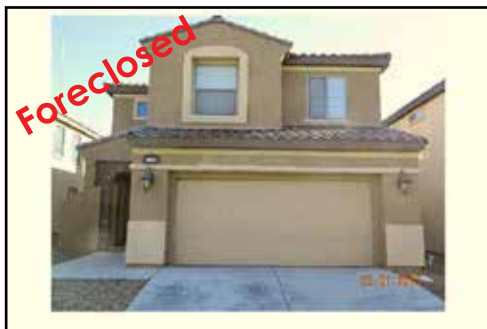
Ref #1328925 • 4 Bedrooms • 2.5 Baths • 2641 Sq. Ft. Year: 2006 • Lot Size: 4792 Sq. Ft. Tuscany • $243,900