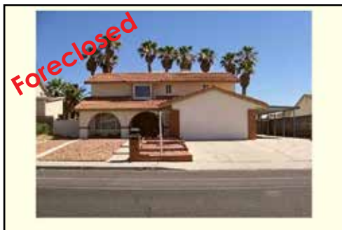
Ref #1358951 • 4 Bedrooms • 2.5 Baths • 2662 Sq. Ft. Year: 1974 • Lot Size: 8712 Sq. Ft. • 1 Carport • Patio $161,900