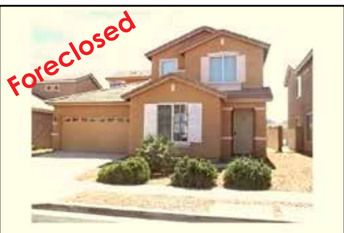
Ref #1331426 • 4 Bedrooms • 3 Baths • 2260 Sq. Ft. Year: 2006 • Lot Size: 4356 Sq. Ft. • Pool Balcony • Boulder Creek • $231,100