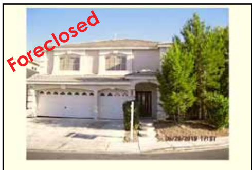
Ref #1352468 • 5 Bedrooms • 3 Baths • 3313 Sq. Ft. Year: 2002 • Lot Size: 5663 Sq. Ft. • Patio Pool • Pinnacle Peaks • $354,900