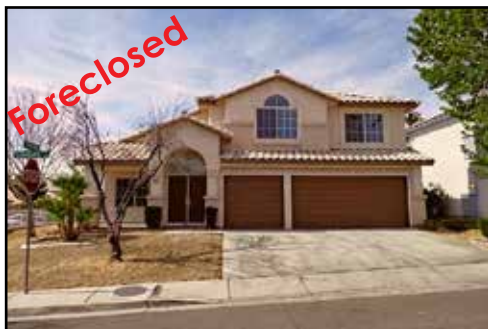
Ref #1351909 • 4 Bedrooms • 3.5 Baths • 2946 Sq. Ft. Year: 1996 • Lot Size: 6534 Sq. Ft. Summerglen • $352,100