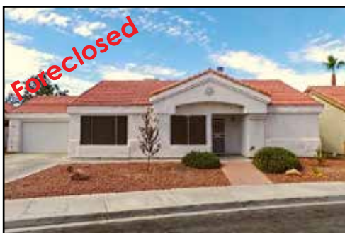
Ref #1362995 • 3 Bedrooms • 2 Baths • 1249 Sq. Ft. Year: 1990 • Lot Size: 5227 Sq. Ft. Sterling Springs • $148,500