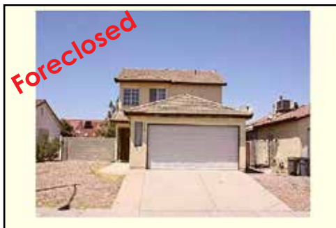
Ref #1352518 • 3 Bedrooms • 2.5 Baths • 1250 Sq. Ft. Year: 1989 • Lot Size: 5227 Sq. Ft. • Patio Cottages • $137,000