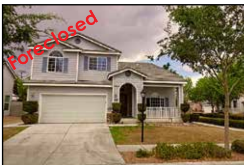
Ref #1362921 • 4 Bedrooms • 1 Den • 3 Baths 2220 Sq. Ft. • Year: 2001 • Lot Size: 4792 Sq. Ft. Lamplight Village • $224,900