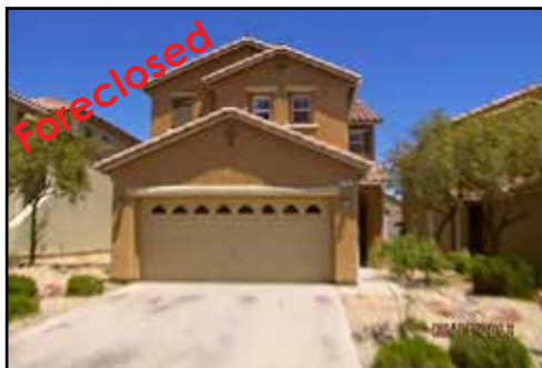
Ref #1358999 • 4 Bedrooms • 3 Baths • 2291 Sq. Ft. Year: 2005 • Lot Size: 3485 Sq. Ft. Russell Grand Canyon • $269,500