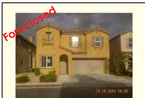
Ref #1337247 • 3 Bedrooms • 2.5 Baths • 1873 Sq. Ft. Year: 2007 • Lot Size: 2614 Sq. Ft. $212,500