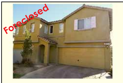
Ref #1328926 • 4 Bedrooms • 2.5 Baths • 1600 Sq. Ft. Year: 2005 • Lot Size: 3049 Sq. Ft. • Patio Newport Downs • $133,100