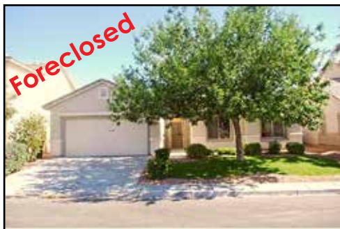
Ref #1352819 • 3 Bedrooms • 2.5 Baths • 1883 Sq. Ft. Year: 2002 • Lot Size: 6098 Sq. Ft. Covered Patio • Highland Hills • $195,000