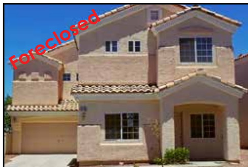
Ref #1360890 • 4 Bedrooms • 2.5 Baths • 2207 Sq. Ft. Year: 2003 • Lot Size: 4356 Sq. Ft. Old Vegas Ranch • $165,000