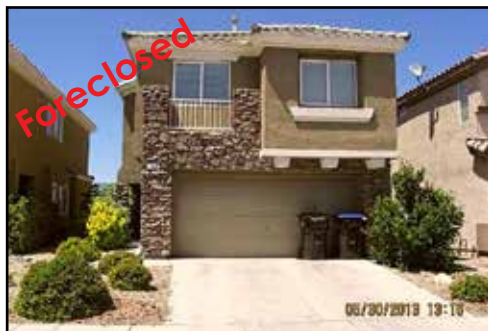
Ref #1358972 • 4 Bedrooms • 3 Baths • 2251 Sq. Ft. Year: 2004 • Lot Size: 3049 Sq. Ft. • Patio Rhodes Ranch • $319,000