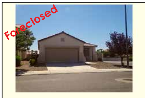
Ref #1357808 • 3 Bedrooms • 2 Baths • 1400 Sq. Ft. Year: 2001 • Lot Size: 5663 Sq. Ft. • Patio Eldorado • $165,000