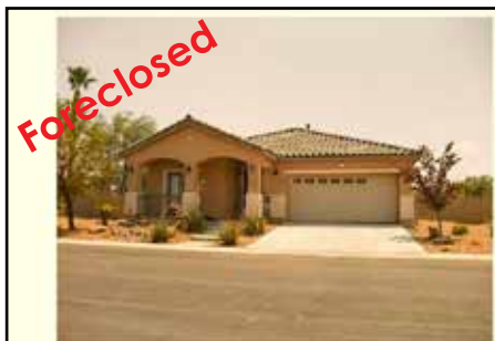
Ref #1362948 • 3 Bedrooms • 2 Baths • 2154 Sq. Ft. Year: 2007 • Lot Size: 9583 Sq. Ft. Covered Patio • $267,500