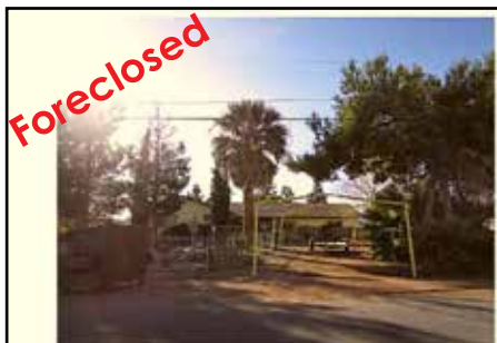
Ref #1312720 • 4 Bedrooms • 1 Den • 2 Baths 2624 Sq. Ft. • Year: 1977 • Lot Size: 49223 Sq. Ft. Covered Patio • $264,900