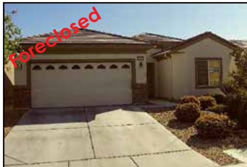
Ref #1347852 • 3 Bedrooms • 1 Den • 2 Baths 1718 Sq. Ft. • Year: 2007 • Lot Size: 5227 Sq. Ft. Covered Patio • Sun City • $222,100