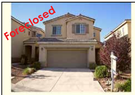
Ref #1352476 • 3 Bedrooms • 2.5 Baths • 1936 Sq. Ft. Year: 2005 • Lot Size: 3485 Sq. Ft. Covered Patio • Wineridge Estates • $212,900