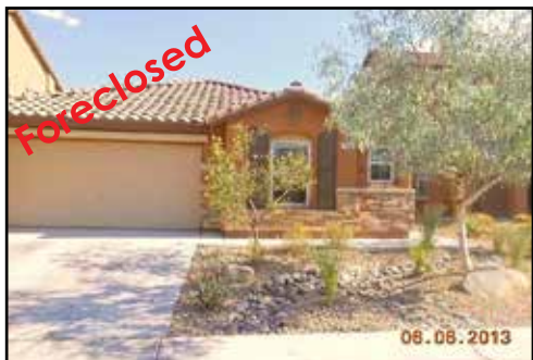
Ref #1352895 • 3 Bedrooms • 1 Den • 2 Baths 1867 Sq. Ft. • Year: 2007 • Lot Size: 4356 Sq. Ft. Chaco Canyon • $242,100