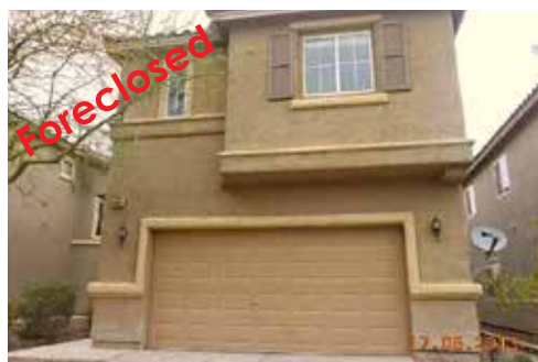
Ref #1350026 • 3 Bedrooms • 2.5 Baths • 1908 Sq. Ft. Year: 2005 • Lot Size: 3485 Sq. Ft. Sunrise Canyon • $165,100