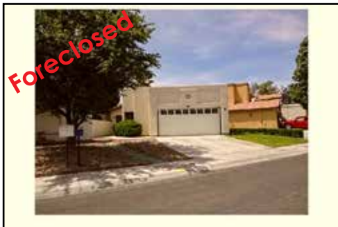
Ref #1360880 • 3 Bedrooms • 2 Baths • 1307 Sq. Ft. Year: 1986 • Lot Size: 4356 Sq. Ft. Woodcrest • $146,500

Don't see what you want? Call or Visit our website! 878-SAVE • BUYLVFORECLOSURE.COM (7283)