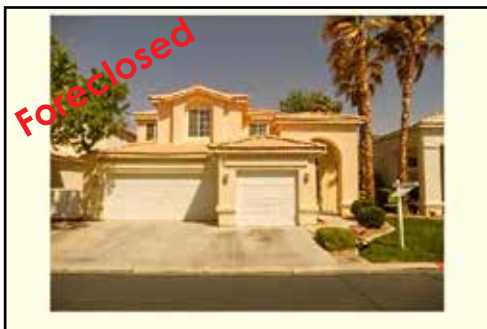
Ref #1340733 • 4 Bedrooms • 2.5 Baths • 2325 Sq. Ft. Year: 1999 • Lot Size: 5227 Sq. Ft. Covered Patio • Painted Desert • $263,500