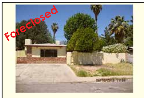
Ref #1346485 • 3 Bedrooms • 2 Baths • 1645 Sq. Ft. Year: 1963 • Lot Size: 6534 Sq. Ft. Del Cerro • $119,900