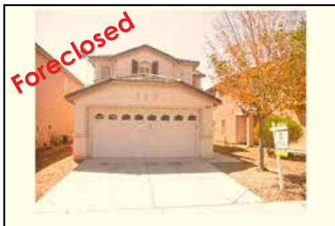
Ref #1348913 • 3 Bedrooms • 2.5 Baths • 1533 Sq. Ft. Year: 2003 • Lot Size: 3485 Sq. Ft. • Patio Iron Mountain • $149,900