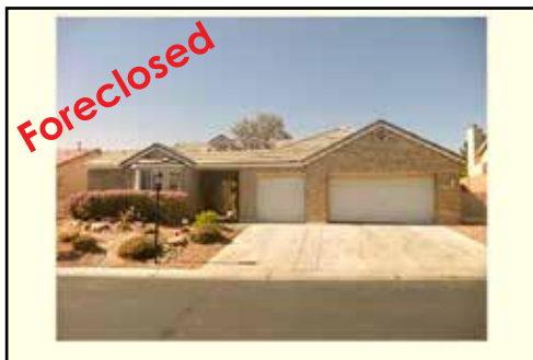
Ref #1356945 • 3 Bedrooms • 3.5 Baths • 2366 Sq. Ft. Year: 2000 • Lot Size: 10454 Sq. Ft. • Pool Covered Patio • Mystic Valley • $308,100