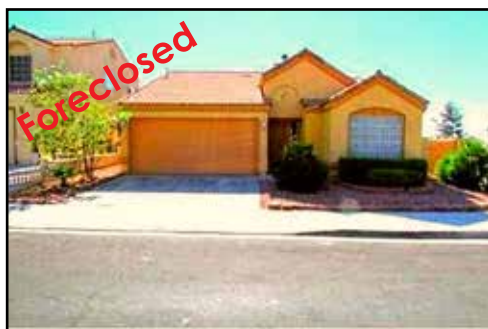
Ref #1356497 • 2 Bedrooms • 2 Baths • 1374 Sq. Ft. Year: 1989 • Lot Size: 5227 Sq. Ft. • Pool Desert Palms • $187,000