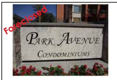
Ref #1351677 • 2 Bedrooms • 2 Baths • 1165 Sq. Ft. Year: 2005 Park Avenue • $159,900