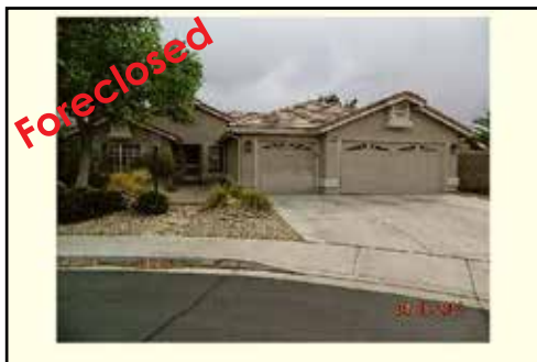
Ref #1340287 • 3 Bedrooms • 2 Baths • 1749 Sq. Ft. Year: 1996 • Lot Size: 8712 Sq. Ft. • Pool Covered Patio • Black Mountain • $261,100