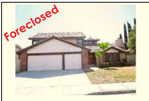
Ref #1346783 • 5 Bedrooms • 3 Baths • 2626 Sq. Ft. Year: 1987 • Lot Size: 8276 Sq. Ft. • Pool Covered Patio • Foxridge Estates • $190,000

Don't see what you want? Call or Visit our website! 878-SAVE • BUYLVFORECLOSURE.COM (7283)