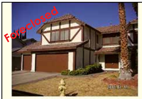
Ref #1337990 • 4 Bedrooms • 1 Den • 2.5 Baths 3031 Sq. Ft. • Year: 1985 • Lot Size: 10019 Sq. Ft. Pool • Covered Patio • Bluffs • $329,900