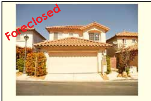
Ref #1340692 • 3 Bedrooms • 2.5 Baths • 1649 Sq. Ft. Year: 1999 • Lot Size: 2614 Sq. Ft. • Patio Santa Barbara • $217,500