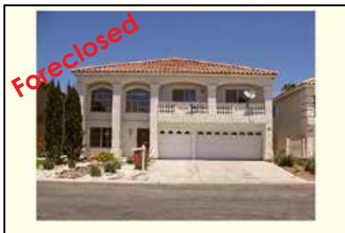
Ref #1354197 • 5 Bedrooms • 3 Baths • 2968 Sq. Ft. Year: 2000 • Lot Size: 6534 Sq. Ft. Balcony • $324,500