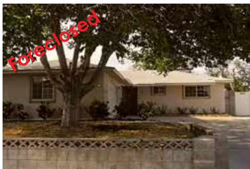
Ref #1343431 • 3 Bedrooms • 2 Baths • 1180 Sq. Ft. Year: 1964 • Lot Size: 5663 Sq. Ft. Covered Patio • Charleston Heights • $119,900