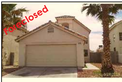
Ref #1332997 • 3 Bedrooms • 2.5 Baths • 1323 Sq. Ft. Year: 2000 • Lot Size: 3485 Sq. Ft. Alexander Villas • $123,500