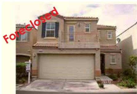
Ref #1354587 • 3 Bedrooms • 2.5 Baths • 1333 Sq. Ft. Year: 2004 • Lot Size: 1742 Sq. Ft. • Patio Balcony • $177,500