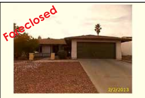
Ref #1321785 • 3 Bedrooms • 2 Baths • 1505 Sq. Ft. Year: 1978 • Lot Size: 6970 Sq. Ft. Covered Patio • Greenway Gardens • $155,100