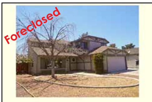
Ref #1352156 • 4 Bedrooms • 2.5 Baths • 1868 Sq. Ft. Year: 1984 • Lot Size: 6098 Sq. Ft. • Pool Spring Valley • $231,100