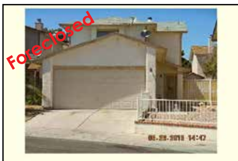
Ref #1360468 • 3 Bedrooms • 2.5 Baths • 1503 Sq. Ft. Year: 1984 • Lot Size: 3049 Sq. Ft. Marion View • $144,500