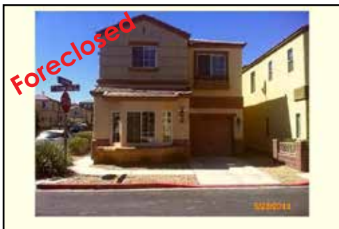
Ref #1350428 • 3 Bedrooms • 2.5 Baths • 1412 Sq. Ft. Year: 2004 • Lot Size: 2178 Sq. Ft. $148,500