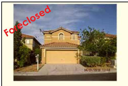
Ref #1341050 • 4 Bedrooms • 3 Baths • 2287 Sq. Ft. Year: 2004 • Lot Size: 3485 Sq. Ft. • Patio Sunset Pines • $244,500