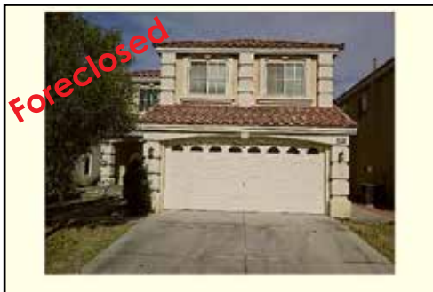
Ref #1340278 • 3 Bedrooms • 1 Den • 2.5 Baths 2001 Sq. Ft. • Year: 2003 • Lot Size: 3920 Sq. Ft. Covered Patio • $234,900

Don't see what you want? Call or Visit our website! 878-SAVE • BUYLVFORECLOSURE.COM (7283)