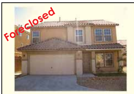
Ref #1348241 • 5 Bedrooms • 2.5 Baths • 2781 Sq. Ft. Year: 2004 • Lot Size: 8276 Sq. Ft. • Patio $268,500