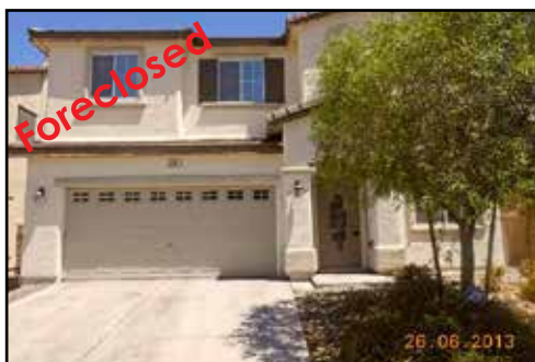
Ref #1359459 • 5 Bedrooms • 3 Baths • 2315 Sq. Ft. Year: 2007 • Lot Size: 5663 Sq. Ft. • Patio Laurel Canyon • $209,100