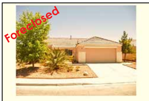
Ref #1360132 • 3 Bedrooms • 2 Baths • 1646 Sq. Ft. Year: 2001 • Lot Size: 6534 Sq. Ft. Covered Patio • $187,000