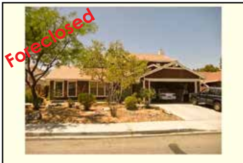
Ref #1356917 • 4 Bedrooms • 3.5 Baths • 2055 Sq. Ft. Year: 1984 • Lot Size: 6534 Sq. Ft. • Pool Covered Patio • Spring Valley • $284,900

Don't see what you want? Call or Visit our website! 878-SAVE • BUYLVFORECLOSURE.COM (7283)