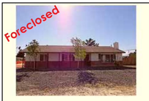
Ref #1360900 • 3 Bedrooms • 2 Baths • 1506 Sq. Ft. Year: 1976 • Lot Size: 21780 Sq. Ft. • Pool Covered Patio • Meikle Manor • $136,500