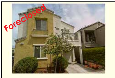
Ref #1351848 • 3 Bedrooms • 2.5 Baths • 1549 Sq. Ft. Year: 2007 • Lot Size: 2178 Sq. Ft. Calusa • $143,100