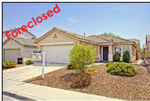
Ref #1360111 • 3 Bedrooms • 2 Baths • 1383 Sq. Ft. Year: 2004 • Lot Size: 4356 Sq. Ft. Covered Patio • Terracina • $178,100