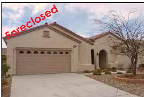
Ref #1341380 • 3 Bedrooms • 2 Baths • 2190 Sq. Ft. Year: 2004 • Lot Size: 7841 Sq. Ft. Covered Patio • Sun City Anthem • $339,900