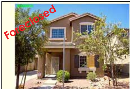
Ref #1353884 • 5 Bedrooms • 3 Baths • 2384 Sq. Ft. Year: 2007 • Lot Size: 4356 Sq. Ft. Balcony • Nevada Ranch • $214,900