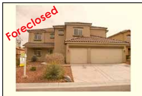
Ref #1336753 • 5 Bedrooms • 4 Baths • 4234 Sq. Ft. Year: 2005 • Lot Size: 8276 Sq. Ft. Covered Patio • La Venita • $335,800