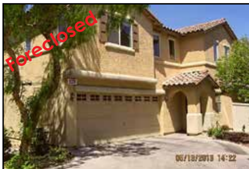
Ref #1348724 • 3 Bedrooms • 2.5 Baths • 1398 Sq. Ft. Year: 2003 • Lot Size: 3049 Sq. Ft. Rhodes Ranch • $179,000

Don't see what you want? Call or Visit our website! 878-SAVE • BUYLVFORECLOSURE.COM (7283)