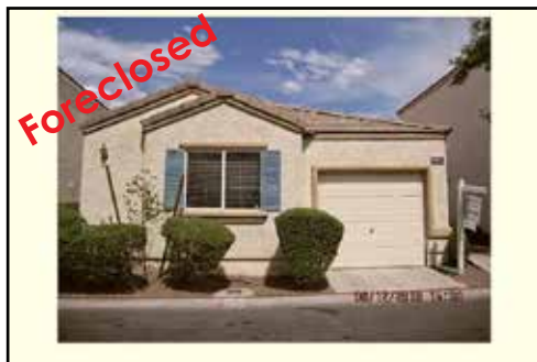
Ref #1360429 • 1 Bedroom • 1 Bath • 643 Sq. Ft. Year: 2002 • Lot Size: 1307 Sq. Ft. $79,900