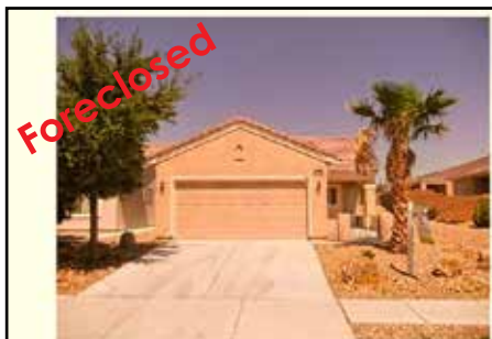
Ref #1353192 • 2 Bedrooms • 2 Baths • 1157 Sq. Ft. Year: 2006 • Lot Size: 5663 Sq. Ft. Covered Patio • Sun City • $181,500