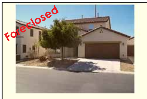
Ref #1338468 • 3 Bedrooms • 2.5 Baths • 1626 Sq. Ft. Year: 2006 • Lot Size: 4356 Sq. Ft. • Patio $148,500