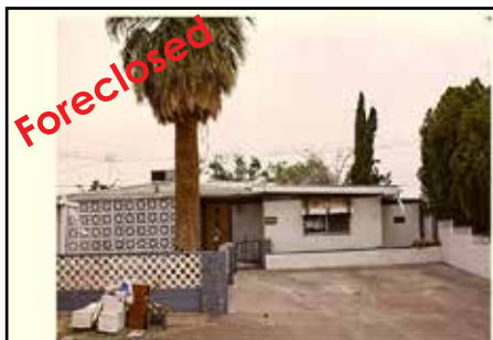
Ref #1347854 • 4 Bedrooms • 2 Baths • 1392 Sq. Ft. Year: 1957 • Lot Size: 6098 Sq. Ft. • Pool Hillcrest Manor • $98,500