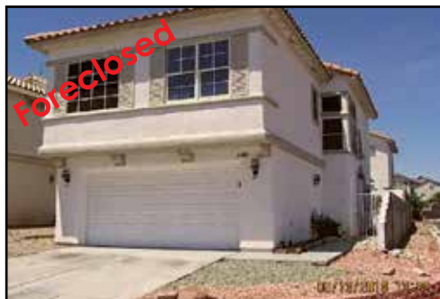
Ref #1353456 • 4 Bedrooms • 1.5 Baths • 1631 Sq. Ft. Year: 1997 • Lot Size: 6970 Sq. Ft. Covered Patio • Sapphire • $214,500