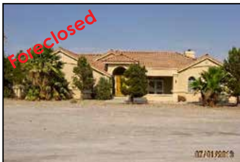
Ref #1362651 • 3 Bedrooms • 2 Baths • 2328 Sq. Ft. Year: 1992 • Lot Size: 21780 Sq. Ft. Covered Patio • Balcony • $278,900