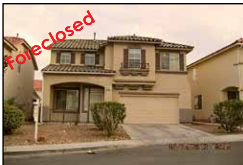
Ref #1332900 • 4 Bedrooms • 3 Baths • 2337 Sq. Ft. Year: 2001 • Lot Size: 4356 Sq. Ft. • Patio Monaco • $254,900

Don't see what you want? Call or Visit our website! 878-SAVE • BUYLVFORECLOSURE.COM (7283)