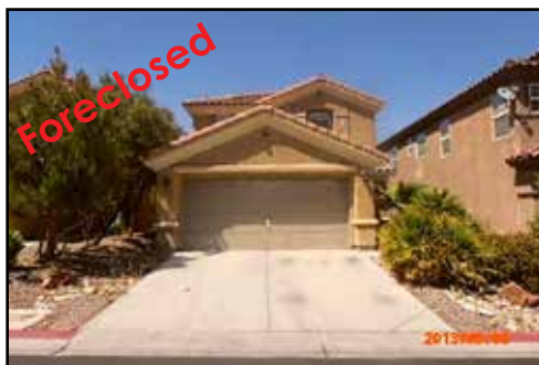
Ref #1350399 • 3 Bedrooms • 2.5 Baths • 2000 Sq. Ft. Year: 2006 • Lot Size: 3485 Sq. Ft. Huntington Village • $212,500