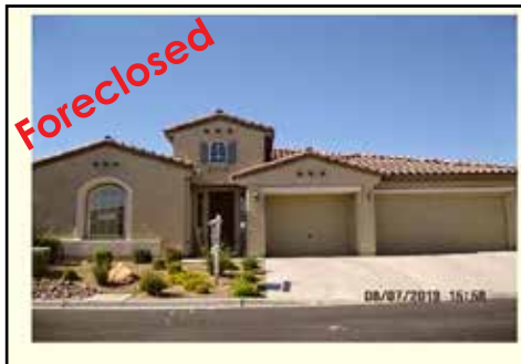
Ref #1354069 • 4 Bedrooms • 3.5 Baths • 3269 Sq. Ft. Year: 2007 • Lot Size: 10890 Sq. Ft. • Patio Mountains Edge • $369,900