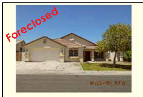
Ref #1354565 • 5 Bedrooms • 3 Baths • 2213 Sq. Ft. Year: 1998 • Lot Size: 6534 Sq. Ft. Covered Patio • Country Lane • $214,900