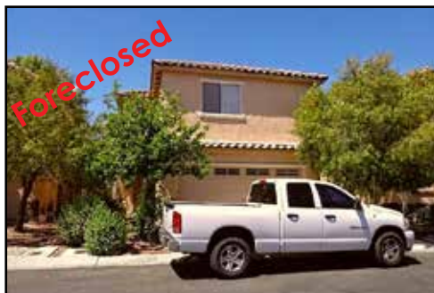
Ref #1356832 • 3 Bedrooms • 2.5 Baths • 1362 Sq. Ft. Year: 2005 • Lot Size: 2178 Sq. Ft. Treasure Cove • $174,900