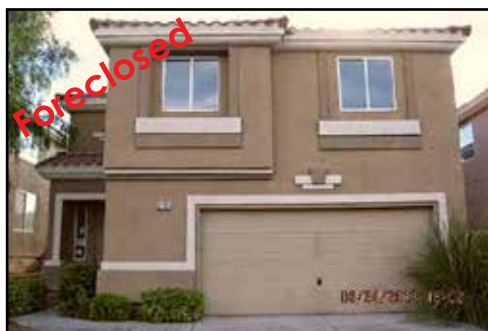
Ref #1360428 • 3 Bedrooms • 2.5 Baths • 2018 Sq. Ft. Year: 2003 • Lot Size: 3485 Sq. Ft. • Patio Rhodes Ranch • $224,500