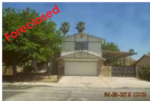
Ref #1342446 • 3 Bedrooms • 2.5 Baths • 1898 Sq. Ft. Year: 1980 • Lot Size: 7841 Sq. Ft. • Pool Covered Patio • Kings Manor • $189,000